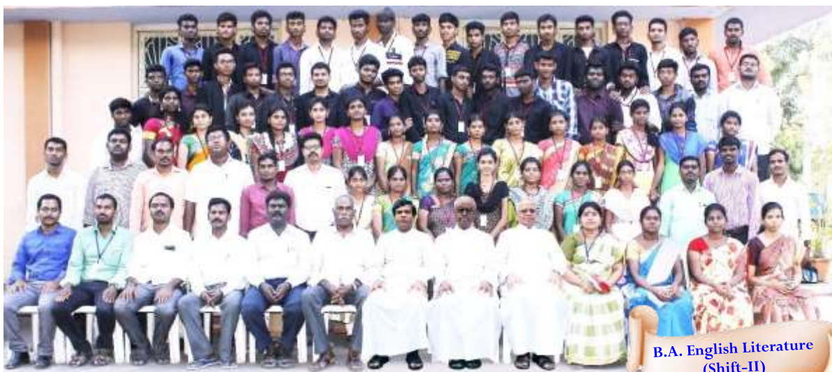
B.A. English Literature (Shift-II)