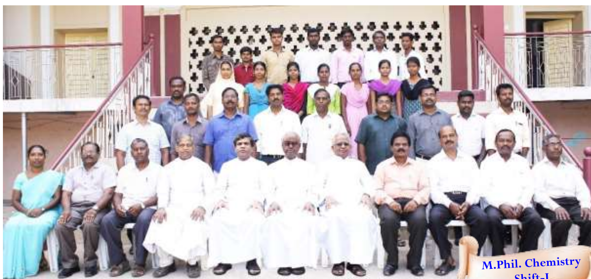
M.Phil. Chemistry Shift-I