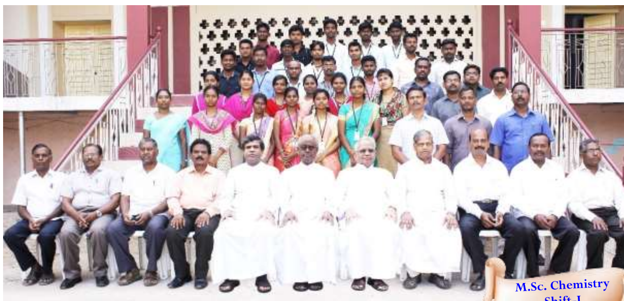
M.Sc. Chemistry Shift-I