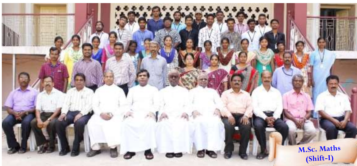
M.Sc. Maths (Shift-I)