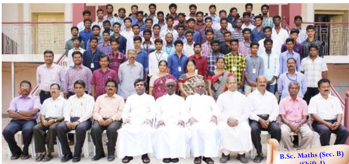
B.Sc. Maths (Sec. B) (Shift-I)