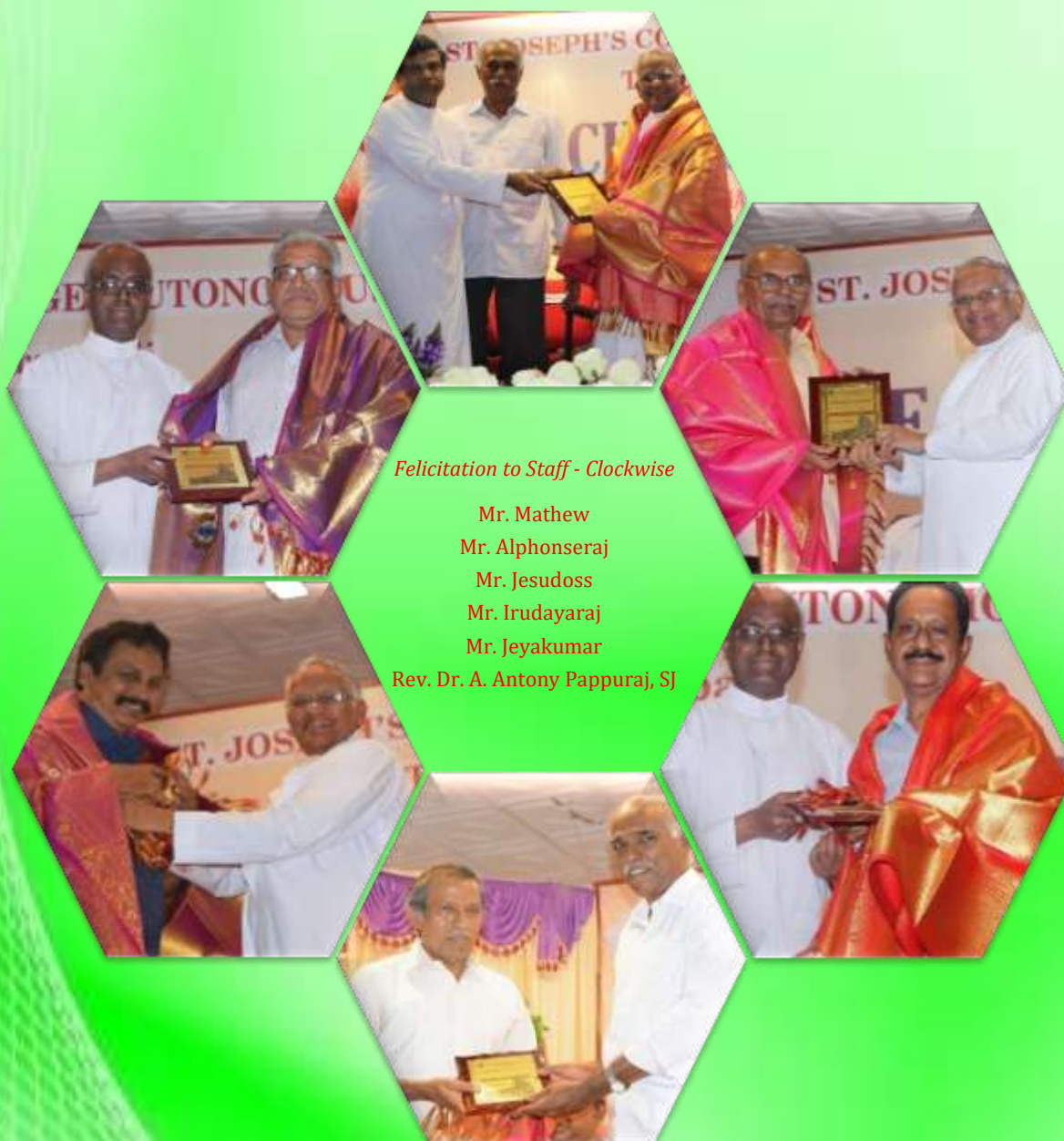
Felicitation to Staff - Clockwise