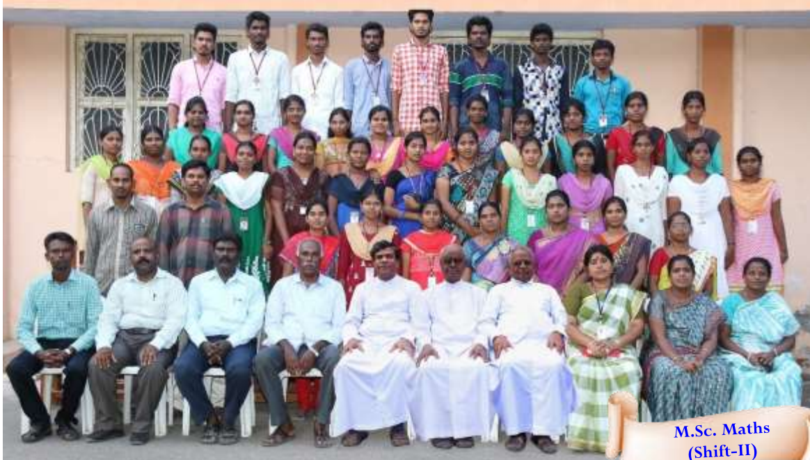
M.Sc. Maths (Shift-II)