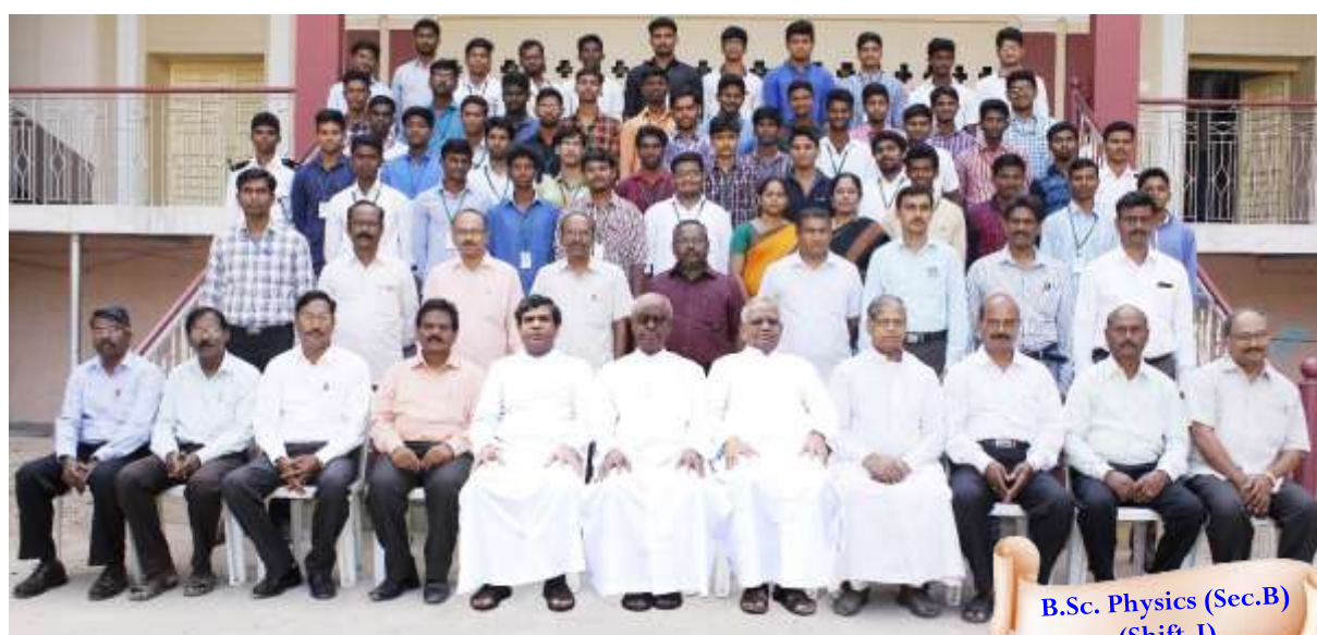
B.Sc. Physics (Sec.B) (Shift-I)