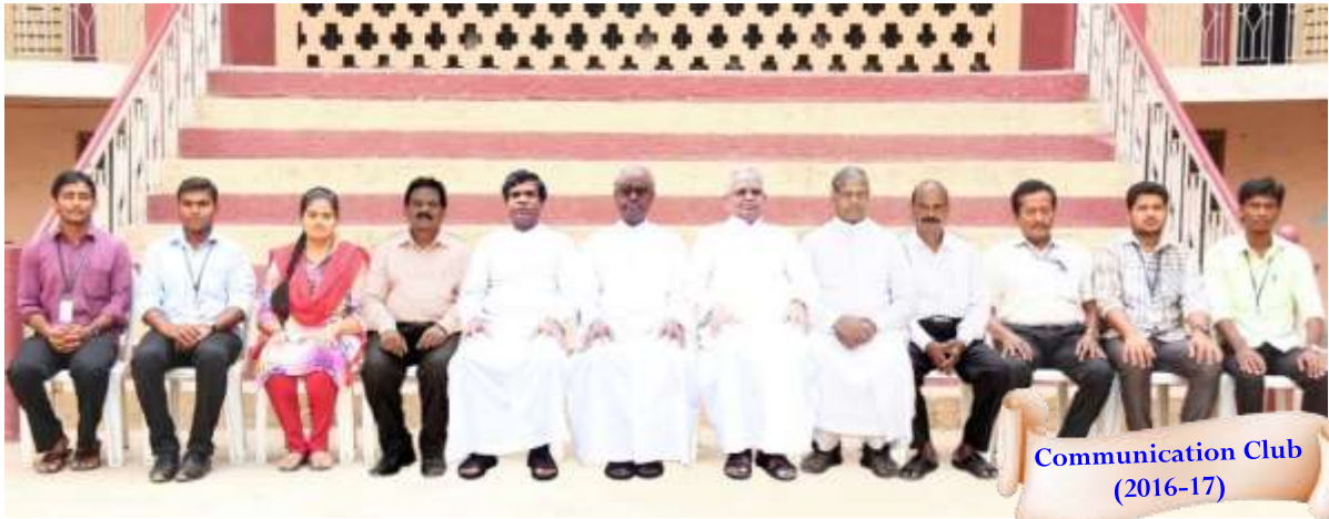
Communication Club (2016-17)