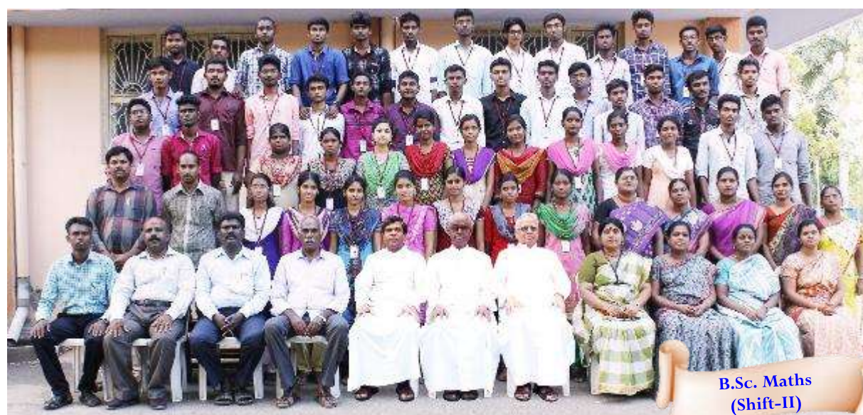
B.Sc. Maths (Shift-II)