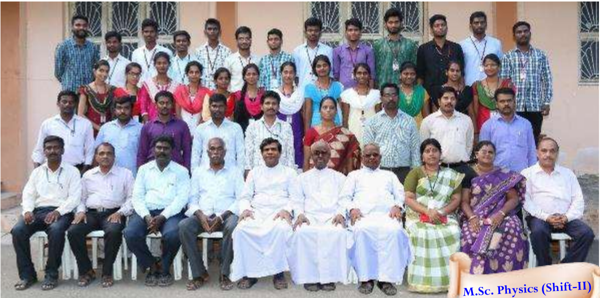
M.Sc. Physics (Shift-II)