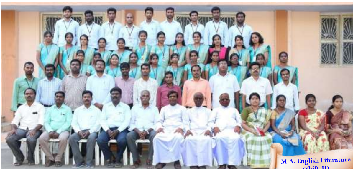
M.A. English Literature (Shift-II)