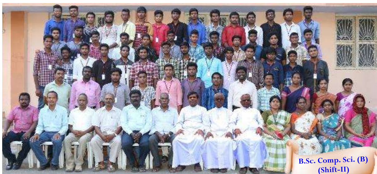
B.Sc. Comp. Sci. (B) (Shift-II)