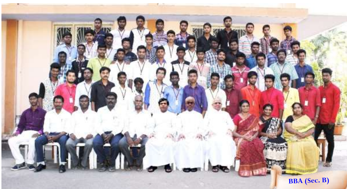
BBA (Sec. B)