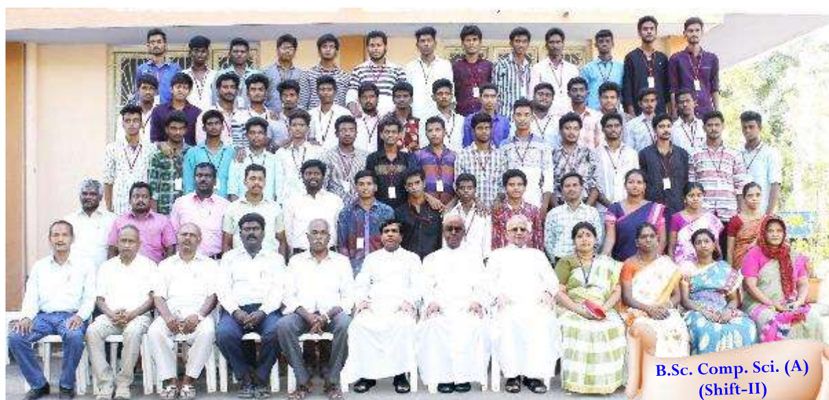
B.Sc. Comp. Sci. (A) (Shift-II)