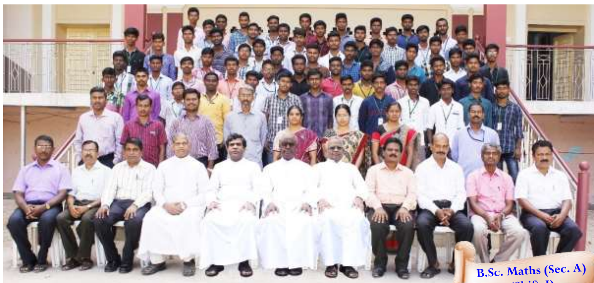
B.Sc. Maths (Sec. A) (Shift-I)