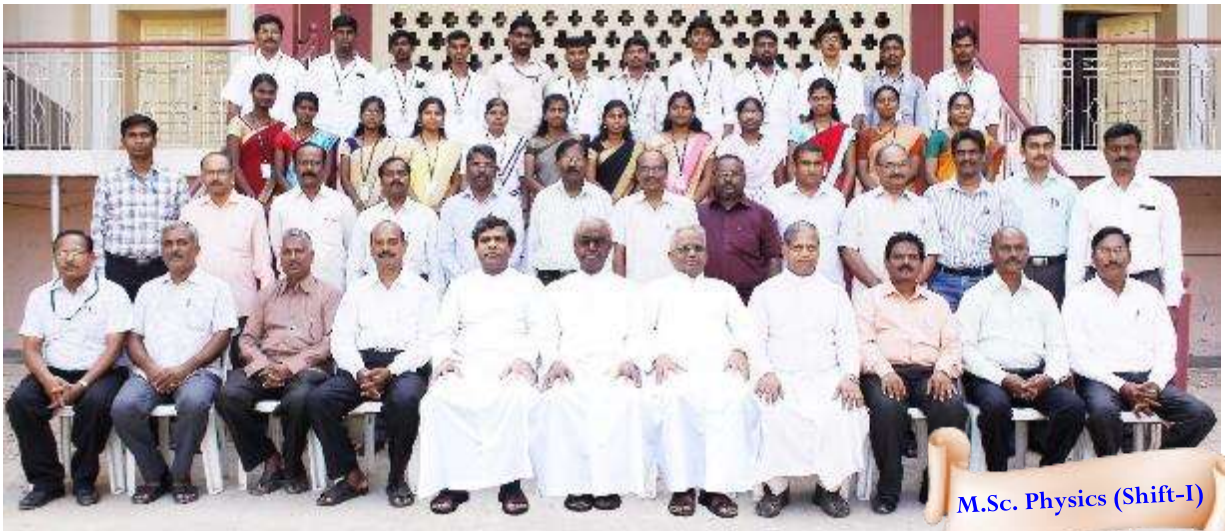
M.Sc. Physics (Shift-I)