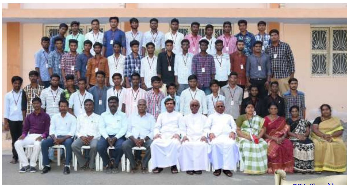
BBA (Sec. A)