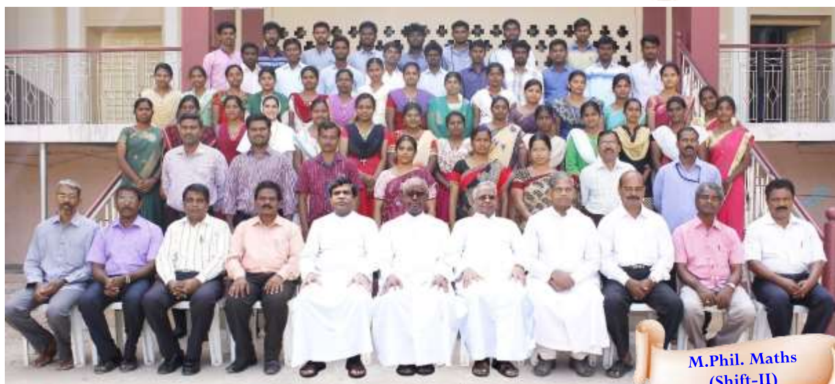
M.Phil. Maths (Shift-II)