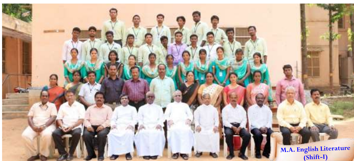
M.A. English Literature (Shift-I)