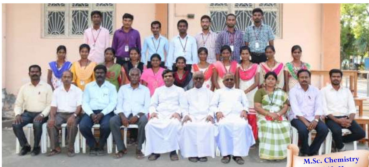
M.Sc. Chemistry Shift-II