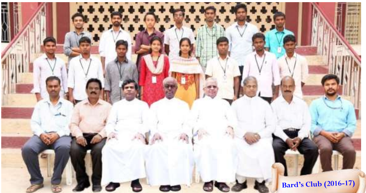
Bard's Club (2016-17)