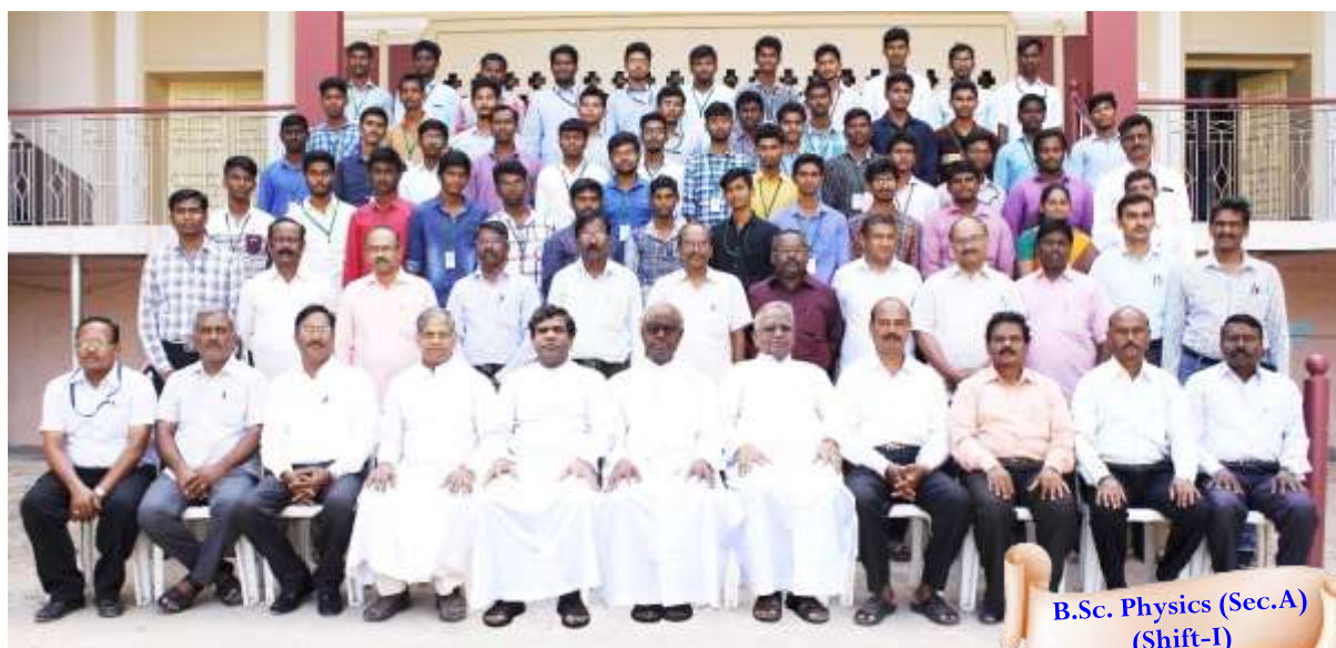
B.Sc. Physics (Sec.A) (Shift-I)