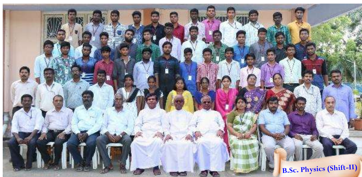
B.Sc. Physics (Shift-II)