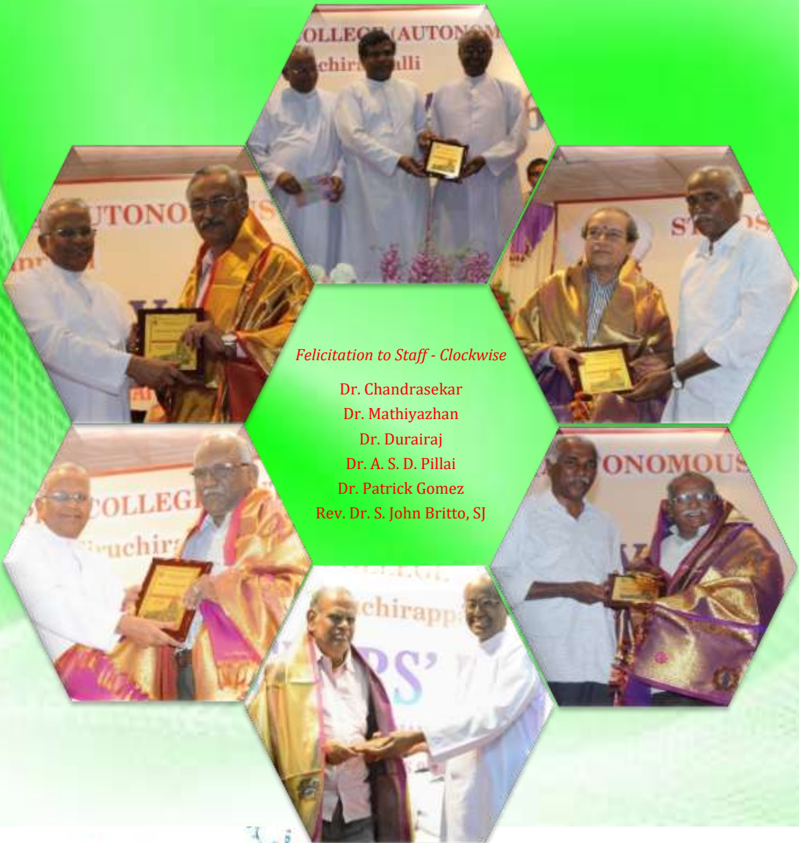
Felicitation to Staff - Clockwise