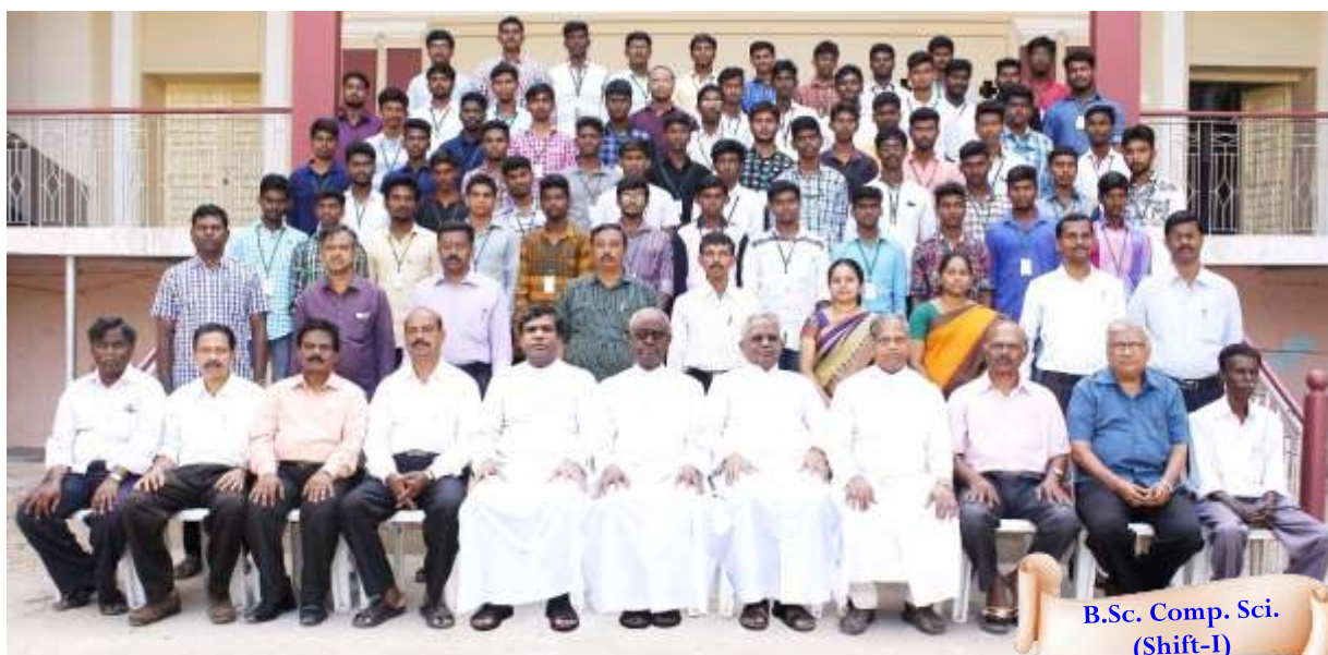
B.Sc. Comp. Sci. (Shift-I)