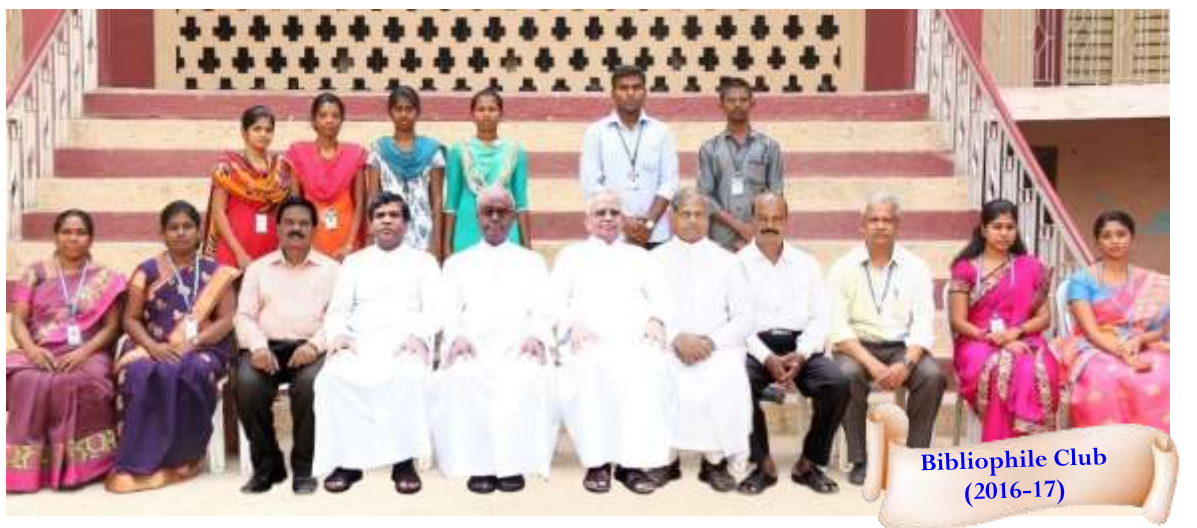
Bibliophile Club (2016-17)